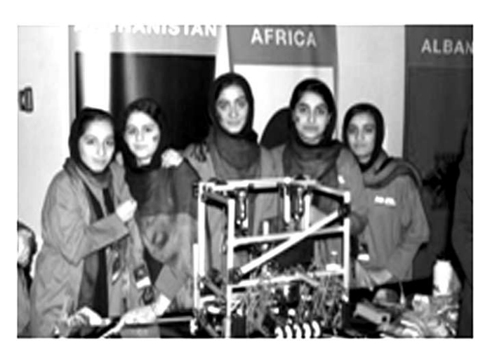
Afghan Girls' Robotics Team Wins First Place In European Competition

Afghanistan's Girl Robotics Team just won the Entrepreneur Challenge at Europe's largest robotics festival, the Robotics festival in Tallinn, Estonia .At Robotics, the team faced off against 3700 other competitors and 1600 robots in a series of competitions, including robot basketball games, races, and mazes. The winning robot, presented by three members of the Afghan team, used solar energy to work on small-scale farms, And that's not the first international robotics award the twelve girls from Herat have bagged. In July, they took home a silver medal for courage in the FIRST Global Challenge in Washington, D.C. For any group of teenagers, those would be an impressive set of achievements, but these six girls come from a country where twothirds of girls never make it to school at all, According to Human rights watch.