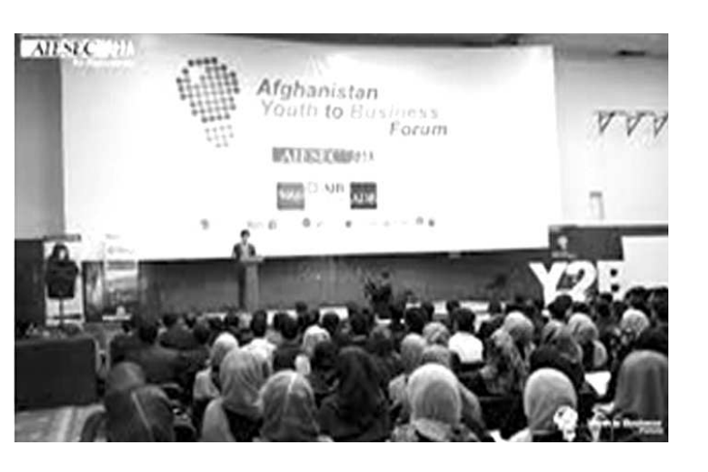
Afghanistan youth business forum in Kabul Afghanistan in International and National Media

Aiesec Afghanistan conducting different developmental programmes for afghan youth awareness some of them are, Afghanistan youth to business forum, Afghanistan youthspeak forum. Through AIESEC global exchange program many afghan youth they are going for cultural exchange to different countries.