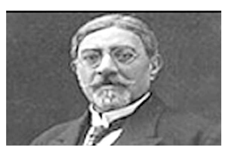
Mahmud tarzi father of journalism of Afghanistan

The government soon promulgated the 1965 press law to regulate the media sector. That reiterated the constitutional