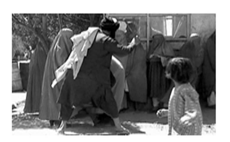
1. Women they are freely doing protest to gain women rights year 2015 2. Taliban beating women in public year 1996

Thetwo picture shows the situation of media in international level