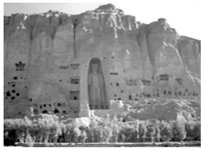
1. Afghan Girl is a 1984 photographic portrait by journalist, Steve McCurry which appeared on the June 1985 cover of national geographic2.Buddha sculpture in Afghanistan