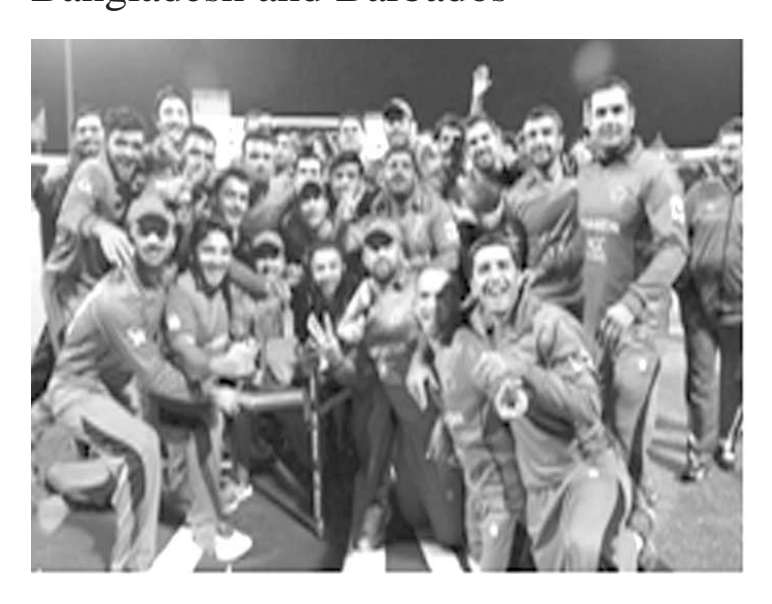
Afghanistan 1 point below India in the latest ICC T20 10 top teams

try in international cricket matches, which makes us more proud of our players. Some people views this sport something new, but cricket has been played in Afghanistan since the mid 19th century, but it is only in recent years that the national team has becomes successful and shinning one. The long-war has affected every sector in Afghanistan, including sports. Afghanistan Ranked 19th in International T-20 cricket as of 7 January 2017 ahead of full members Bangladesh and Zimbabwe. In the same year we won our first Intercontinental Cup, beating Scotland in the final. Cricket team also won the Asia Vs Caribbean T-20 Championship and beat T&T, Bangladesh and Barbados